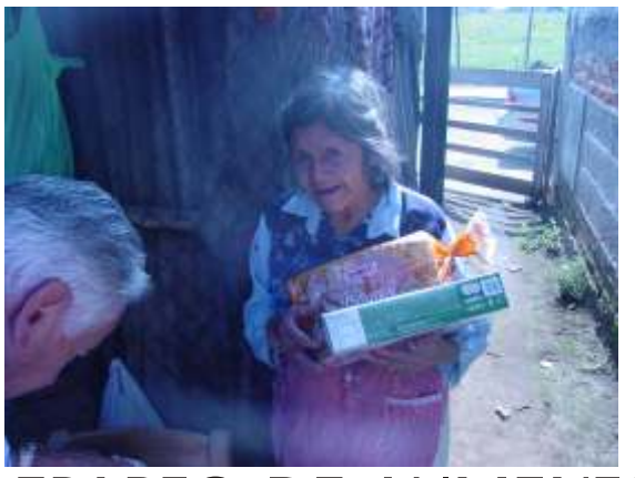
REPARTO DE ALIMENTOS

El dinero recaudado es para financiar los proyectos del club de Leones de Coatepec hacia la comunidad.